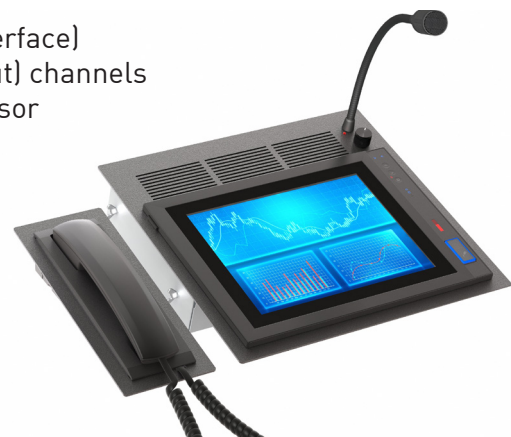
Panel Mount BF10 with Handset